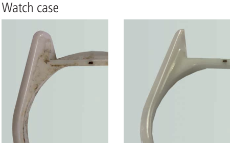
Removal of polishing pastes