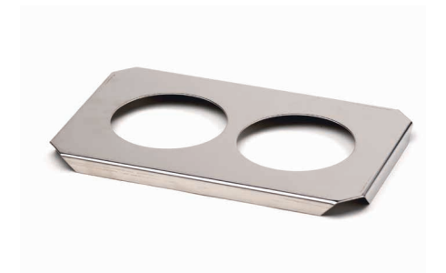
Perforated cover for using beakers