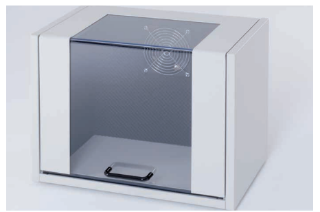
Noise protection box