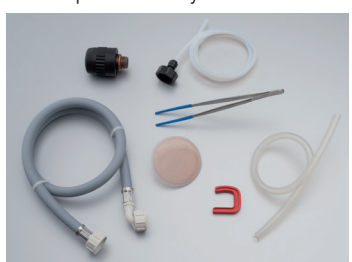
Tweezers \cdot Sieve \cdot Maintenance hose \cdot Rinsing set \cdot Tank cap with safety valve