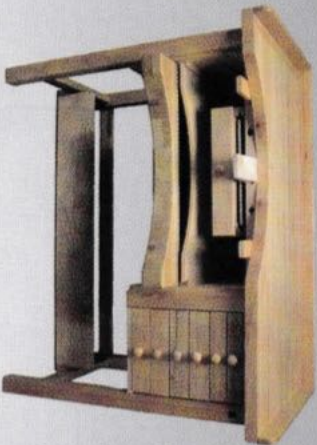
Superior Jewellers Bench (1197)