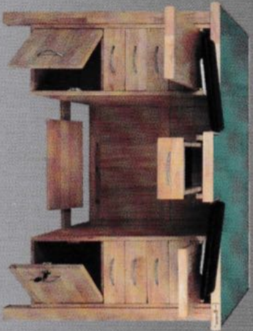
Superior Watchmakers Bench (1851)