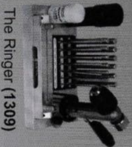
The Ringer (1309)