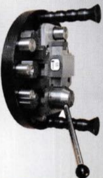
Ring Bender - 7 Piece (1307)